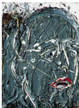
Self-portrait, 2016 46x34cm (8P)