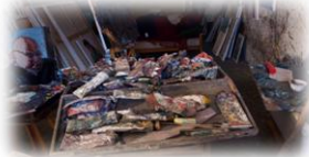
אלכס קרמר (1966)