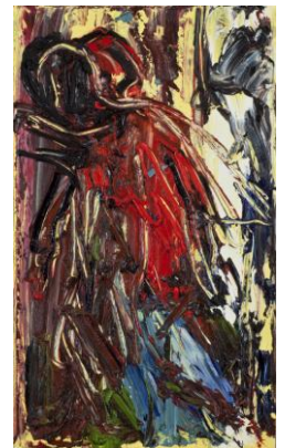
Painter, 2015 80x47cm