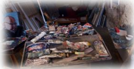
אלכס קרמר (1966)